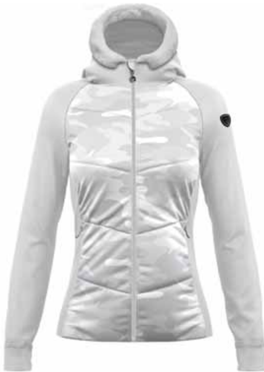
C-1 / 001