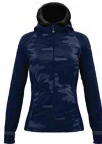
C-7 / 733

Tessuto garzato elasticizzato 4 vie - Protezione termica - Batteriostatico - Antipilling - Protezione UV - Tasca zip al petto Tasche con zip - Fronte giacca trapuntata su tessuto anti-vento - Cappuccio bordato con pelo