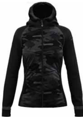
C-9 / 999